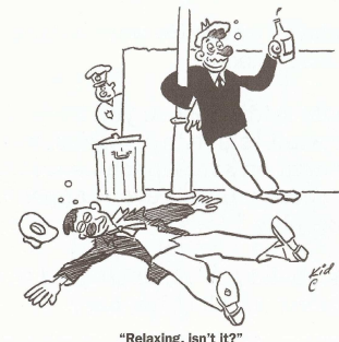
"Relaxing, isn't it?"

An excerpt from "A Rabbit Walks into a Bar: Best Jokes & Cartoons from AA Grapevine"